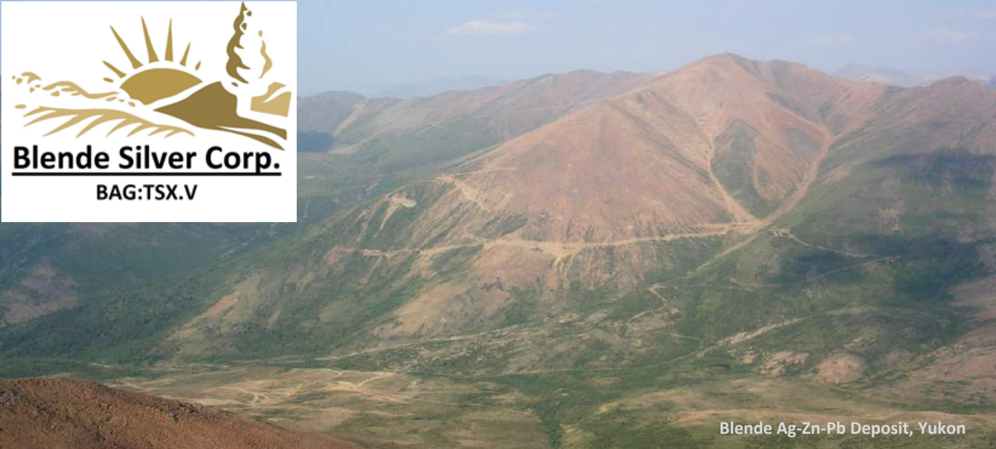
Blende Ag-Zn-Pb Deposit, Yukon